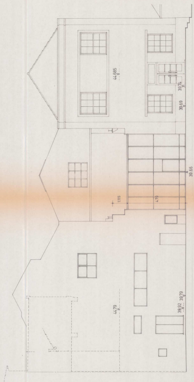
ALÇADO 1 - DE TOPO, VISTO DO PÁTIO